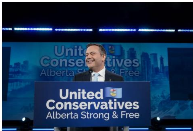
Jason Kenney, leader of the United Conservative Party, delivers his victory speech at a party event in Calgary, Alberta, on Tuesday.