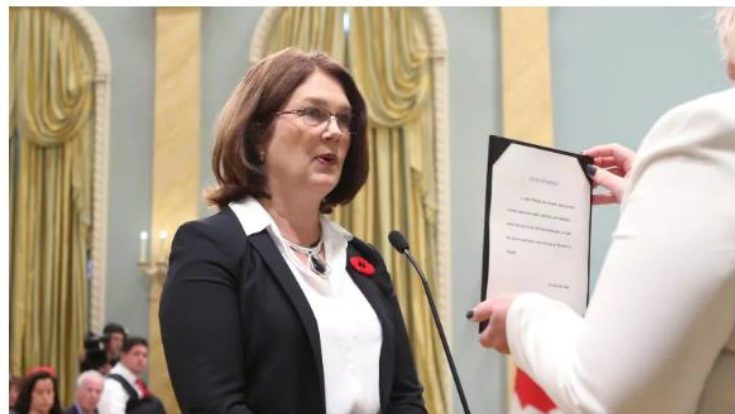
The Liberals can deflect opposition attacks, spin Jody Wilson-Raybould's story and attempt to divert our attention literally to the moon all they want. But Jane Philpott's words ought to eclipse everything else.