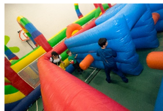
Some of the activities...